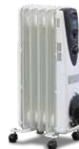
Oil filled radiators - 1kW – 2.5kW