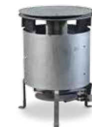
Dustbin Heaters - 25kW 110 / 240 V – 47 Kg Propane