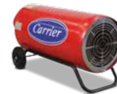
Direct Gas Fired Heaters - 3kW – 86kW 110 / 240 V – 47 Kg Propane