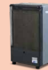
Catalytic Cabinet Heaters - 3.2kW 13 Kg Butane