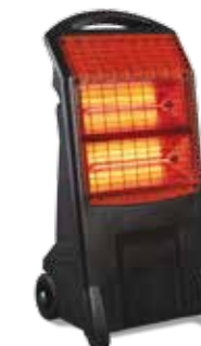
Electric Radiant Heaters - 3kW