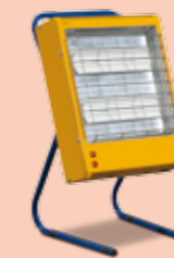
Electric Ceramic Heaters - 1.4kW – 2.4kW